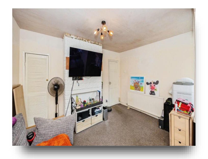
Wellington Street, Southsea PO5 4HT