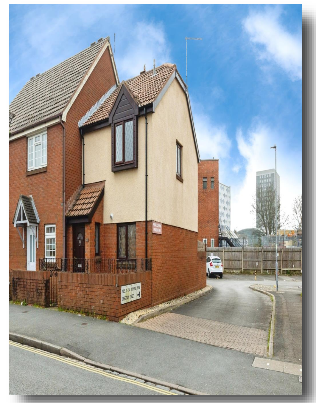
Denning Mews, Southsea PO5 4LE