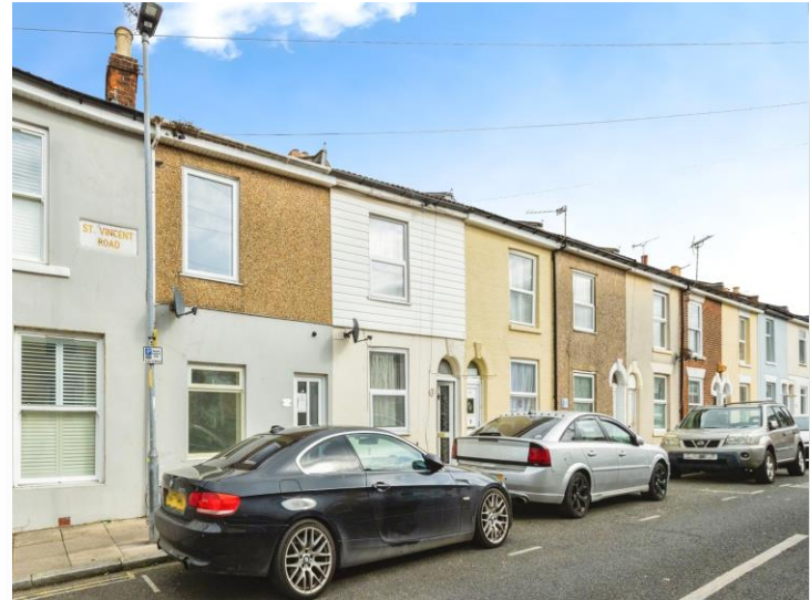
St. Vincent Road, Southsea PO5 2QR