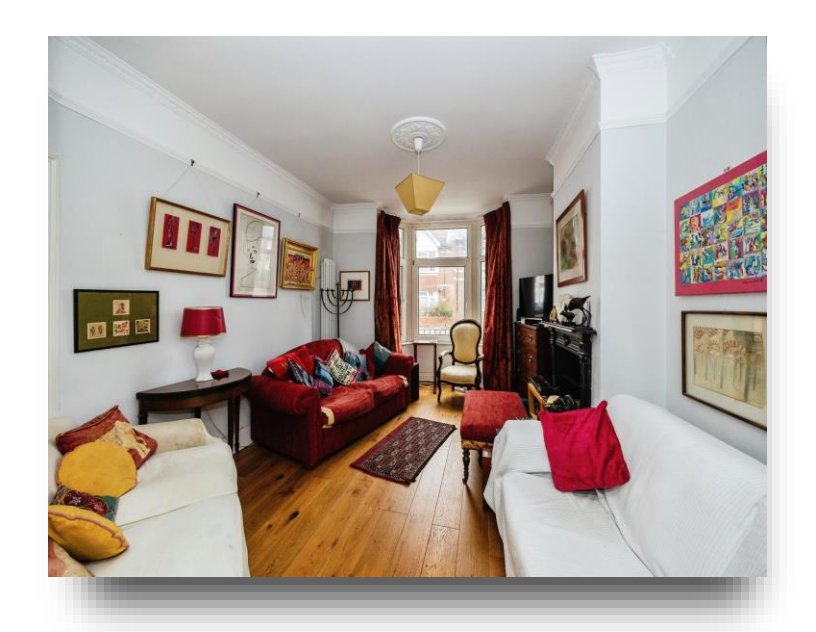
Devonshire Avenue, Southsea PO4 9EG