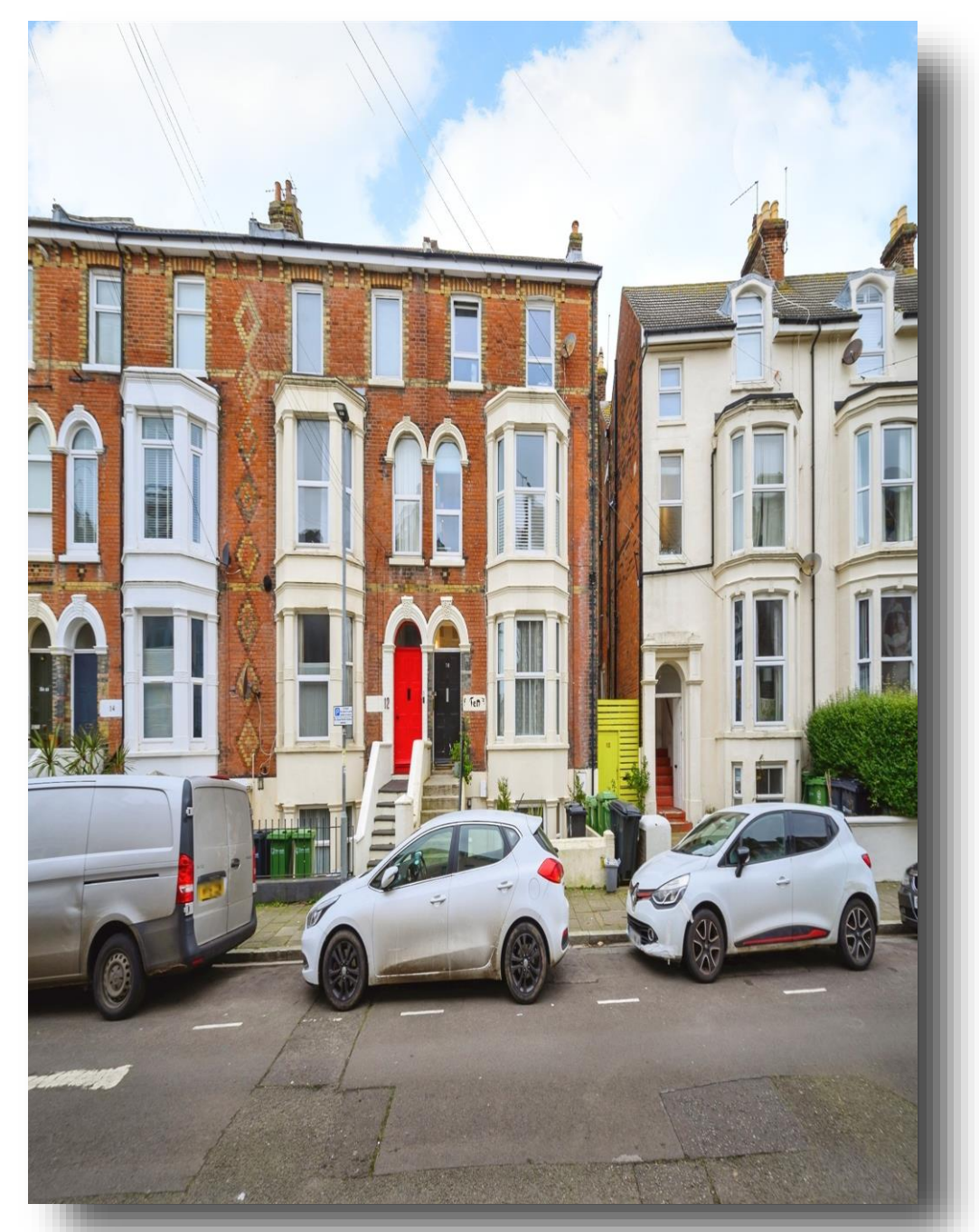
Elphinstone Road, Southsea PO5 3HR