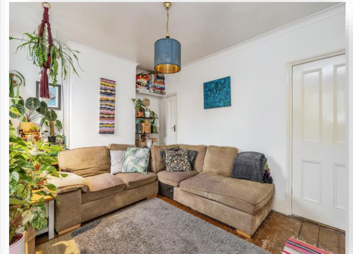
Lawson Road, Southsea PO5 1SE