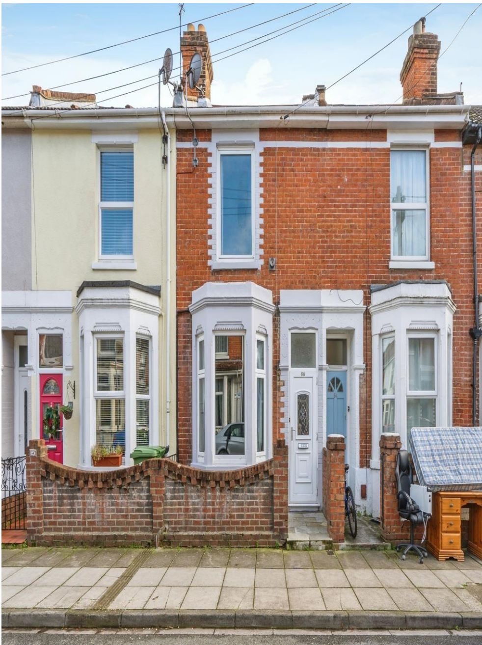
Jubilee Road,SOUTHSEA PO4 0JE