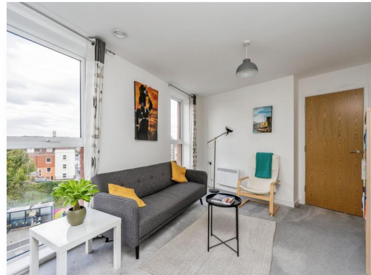
Hollinsworth House Goldsmith Avenue, SOUTHSEA PO4 0EF