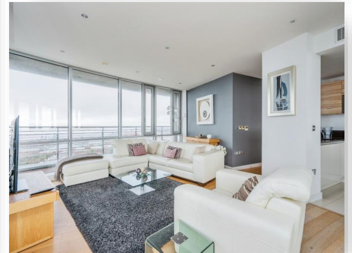
Admiralty Tower Queen Street, Portsmouth PO1 3GA