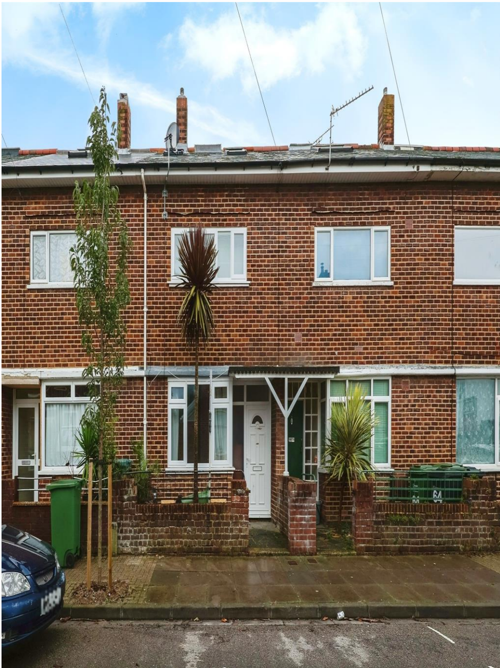
Bath Road, Southsea PO4 0HT