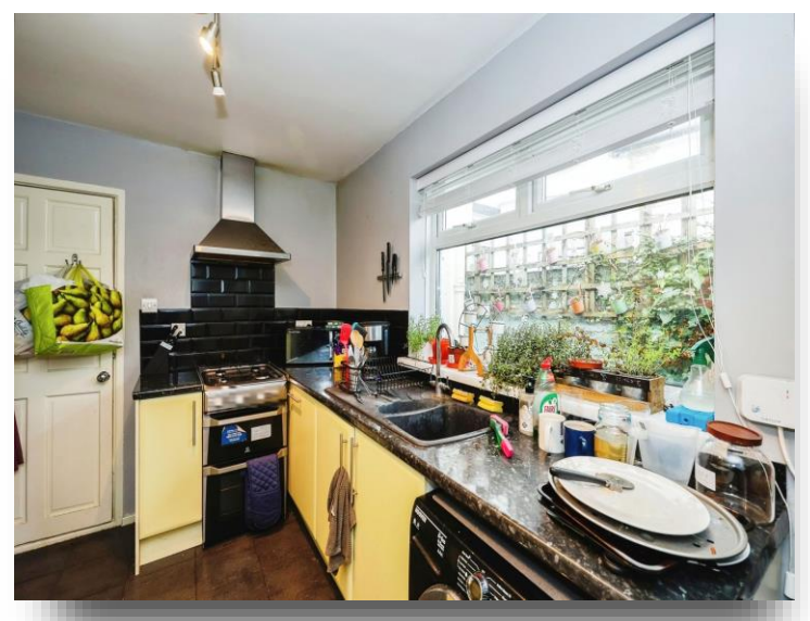
Percy Road, Southsea PO4 0BH