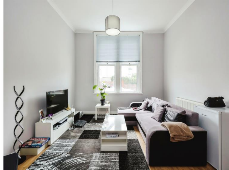
Cottage Grove, Southsea PO5 1EW