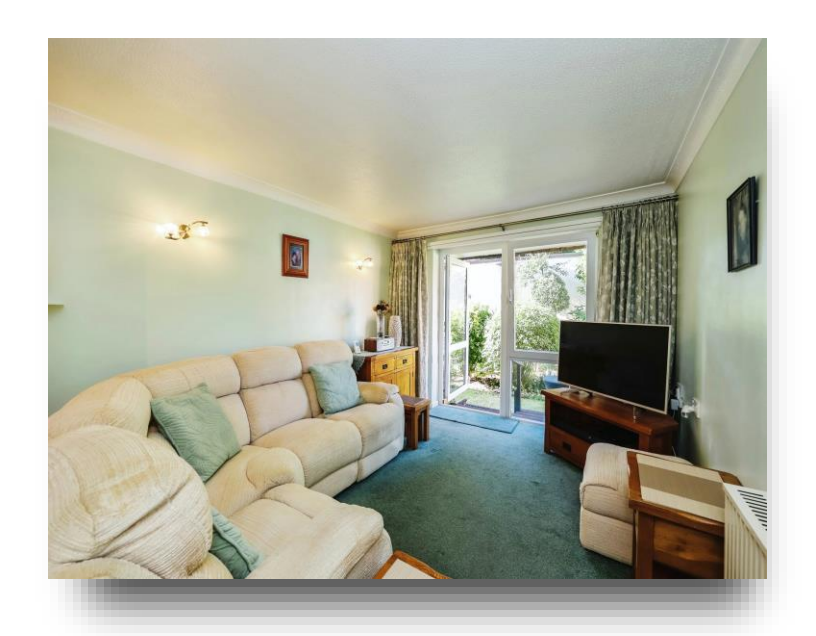
Homerose House Cottage Grove, SOUTHSEA PO5 1DU