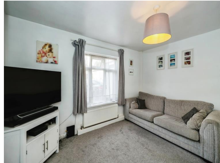
Crofton Road, Southsea PO4 8NX