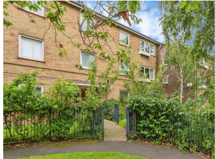
Broom Square, Southsea PO4 8LP