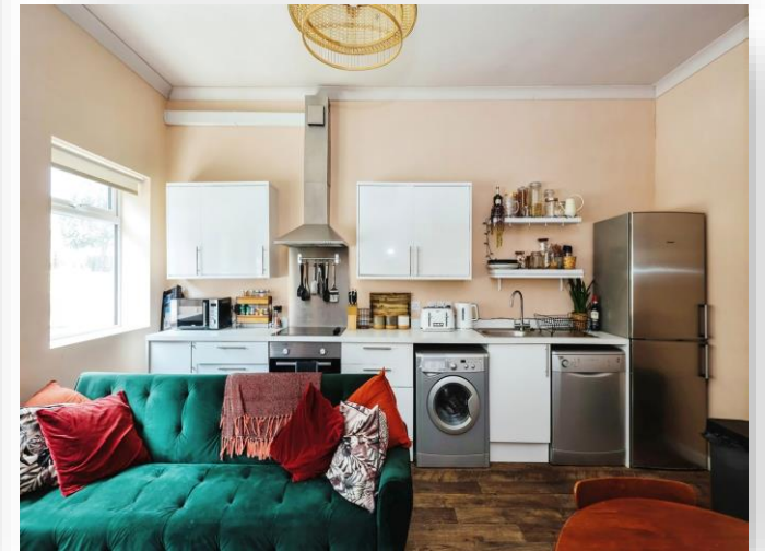
Sheraton Gate Clarendon Road, Southsea PO4 0SL