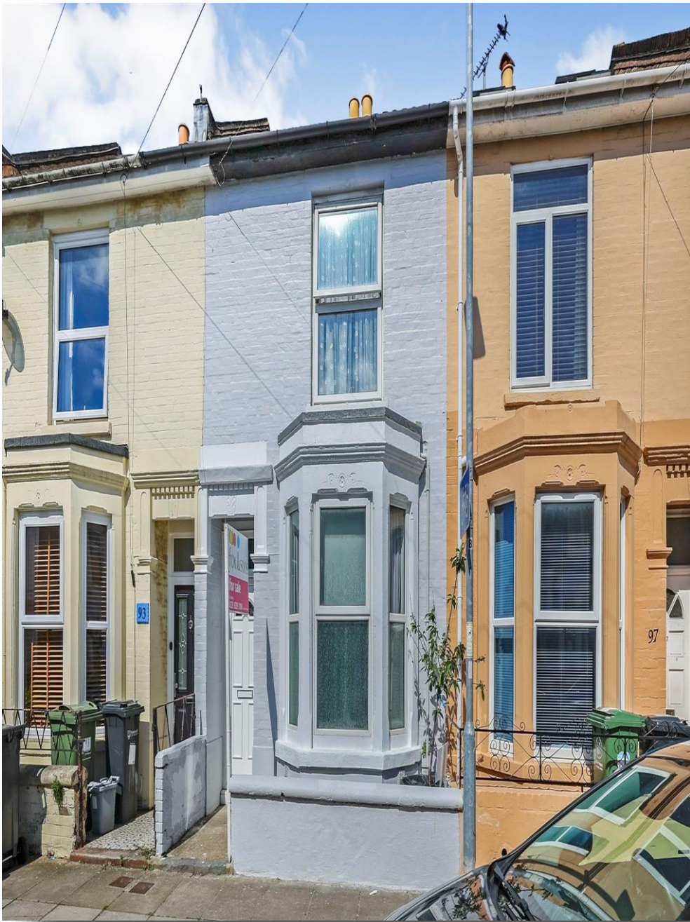
Jubilee Road, SOUTHSEA PO4 0JD