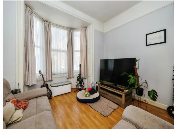
Flat 3 Shaftesbury Road, Southsea PO5 3JP