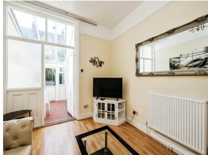
Basement Flat Whitwell Road, Southsea PO4 0QR