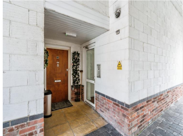
The Arts Centre Reginald Road, SOUTHSEA PO4 9HN