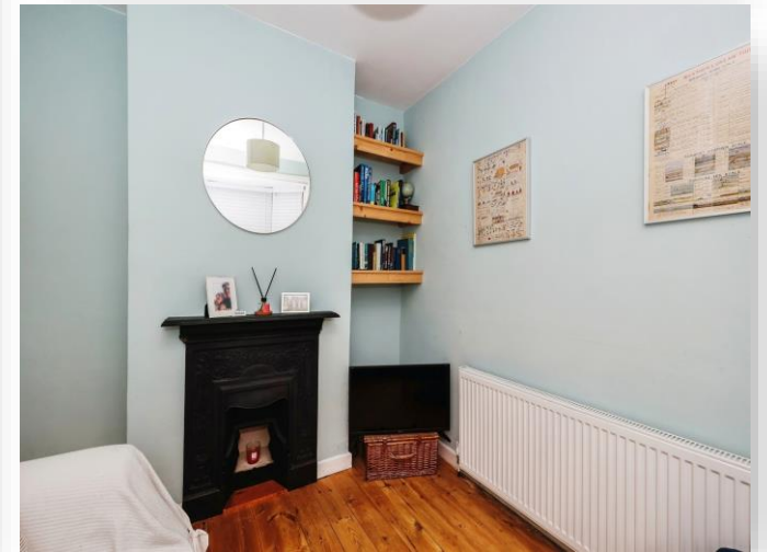
Talbot Road, SOUTHSEA PO4 0HE