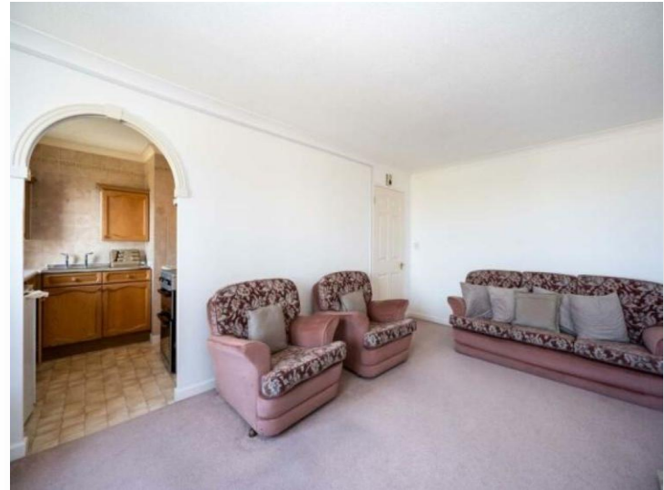
Homeheights Clarence Parade, Southsea PO5 3NW