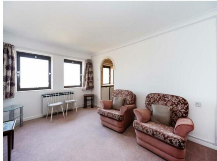
Homeheights Clarence Parade, Southsea PO5 3NW