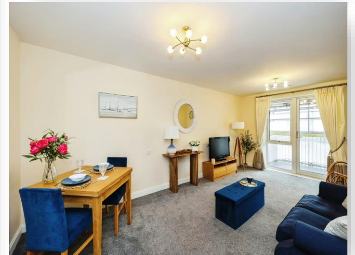
Tudor Rose Court South Parade, Southsea PO4 0DE