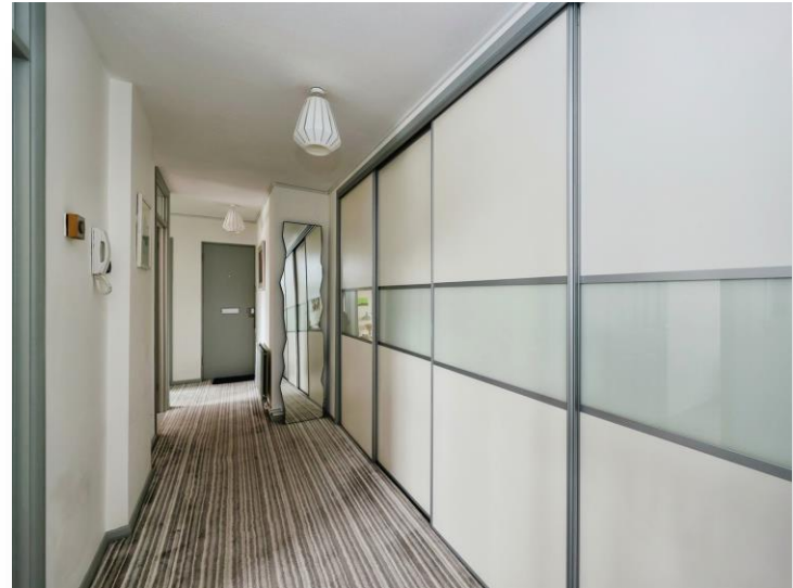
Amersham Court Craneswater Park, Southsea PO4 0NX