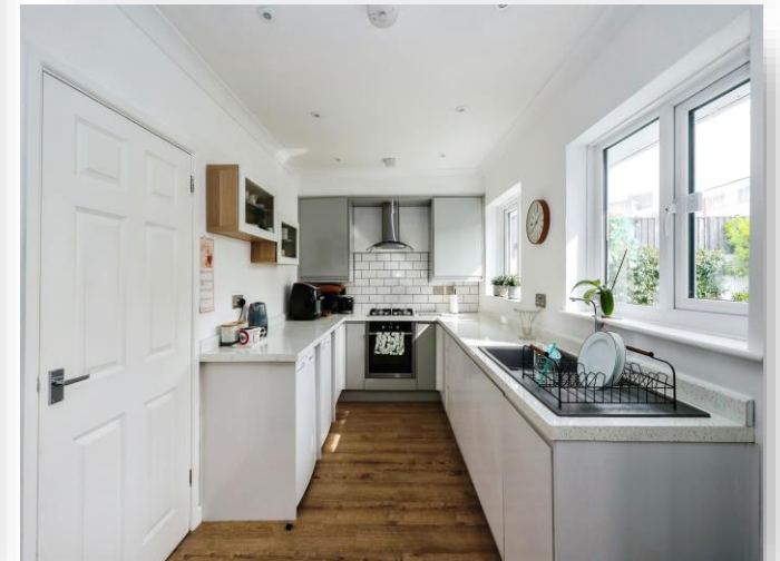
St. Catherine Street, Southsea PO5 2NG