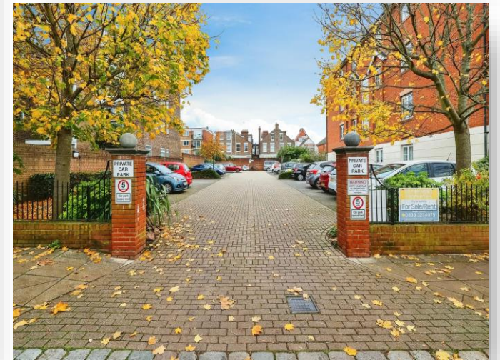
Holmbush Court Queens Crescent, Southsea PO5 3HY