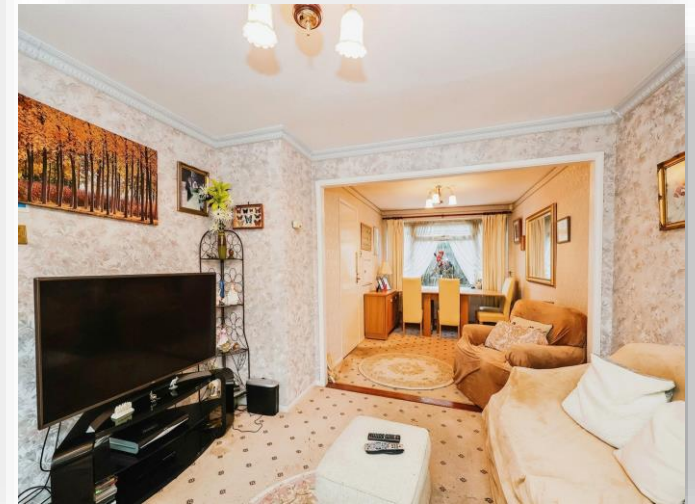
Revenge Close, Southsea PO4 8YE