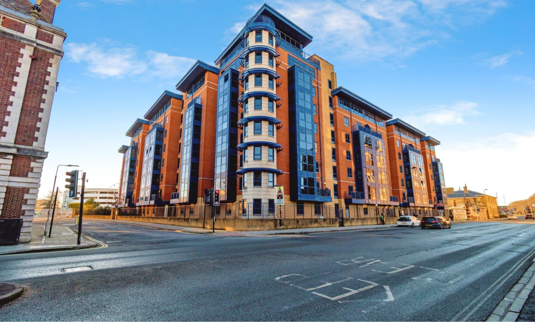
Charter House, Canute Road, Southampton SO14 3FY