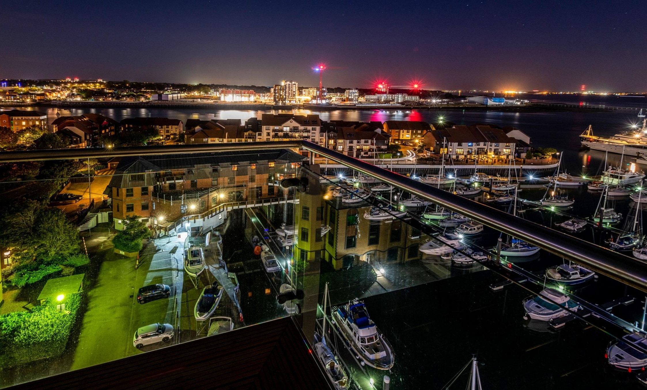
Sundowner, Channel Way, Ocean Village, Southampton, SO14 3JB