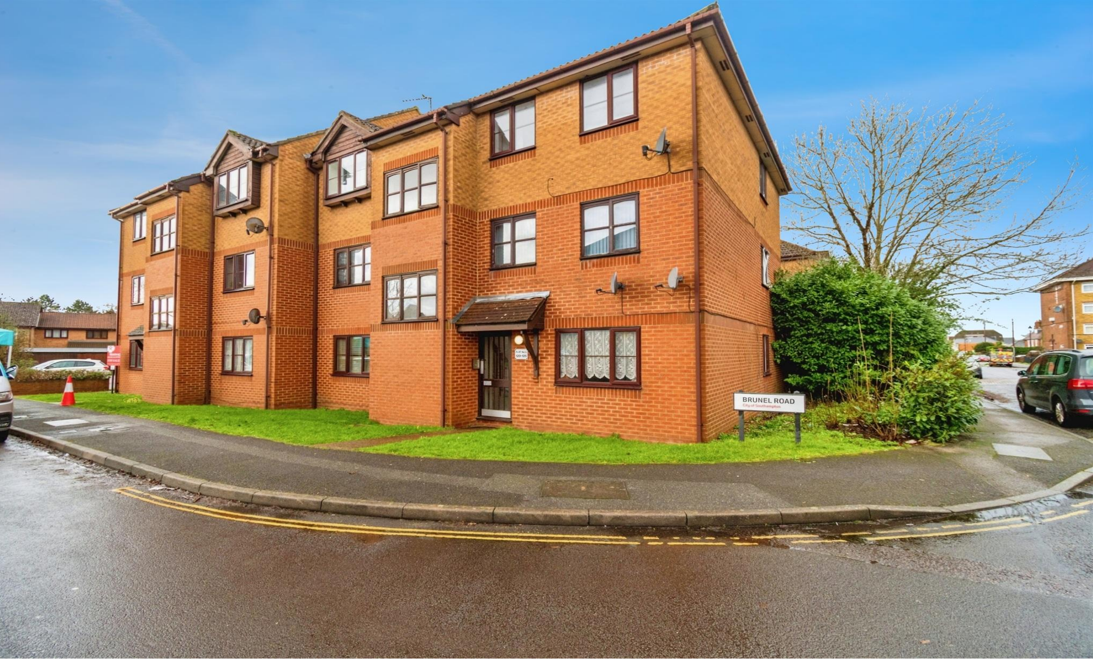
Brunel Road, Southampton SO15 0LR