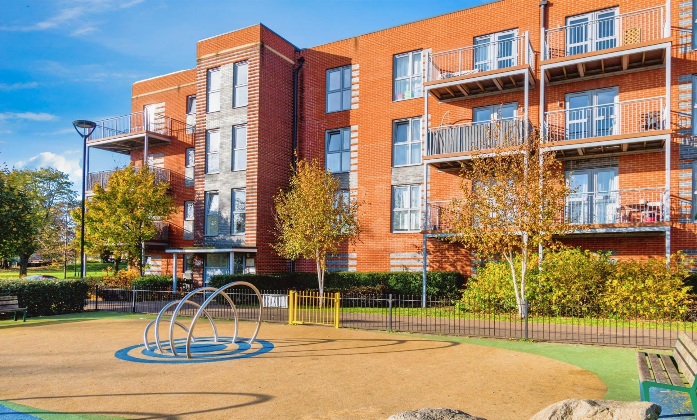
Hamilton House, Meridian Way, Southampton SO14 0FP