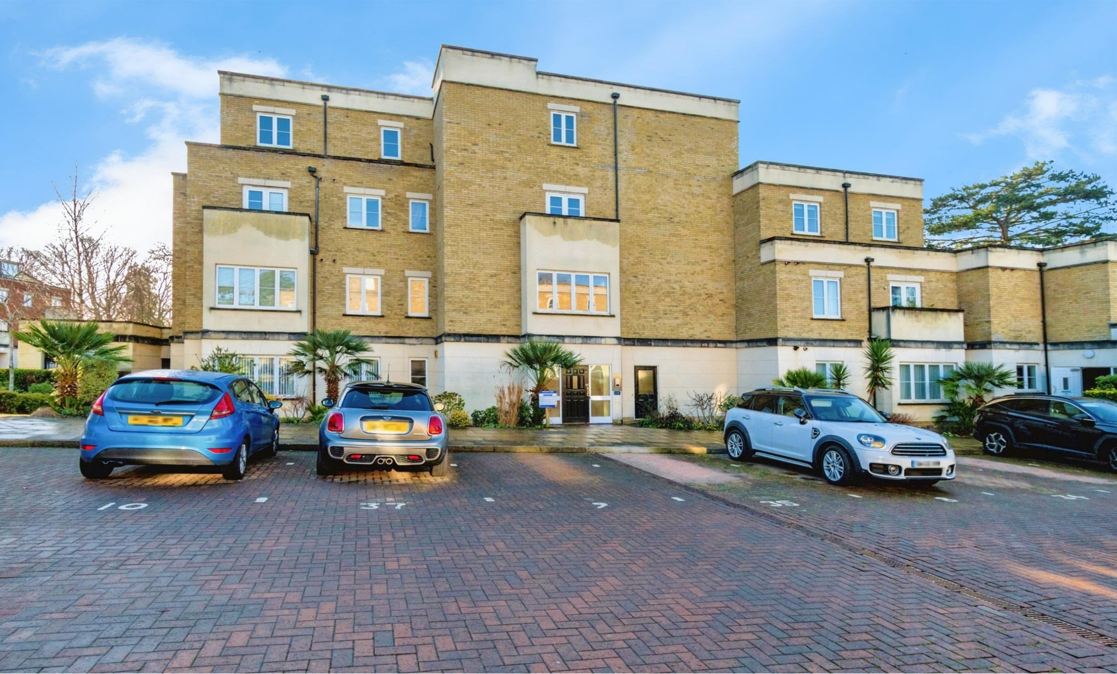
Providence Park, Southampton SO16 7QN