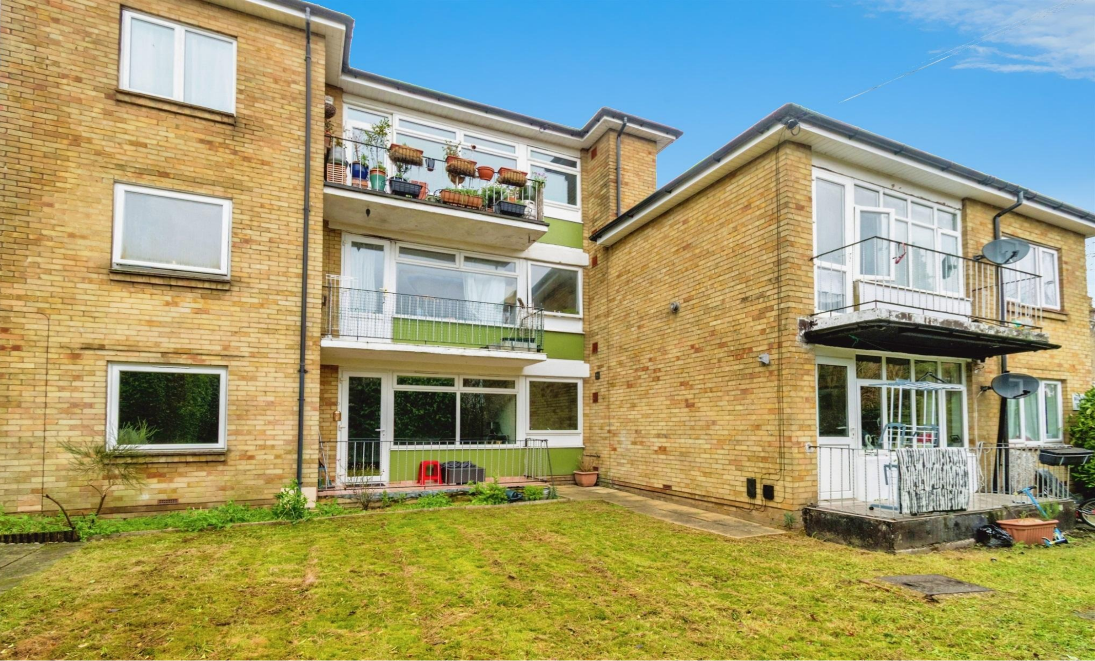
Belmont Court, Belmont Road, Southampton SO17 2UB