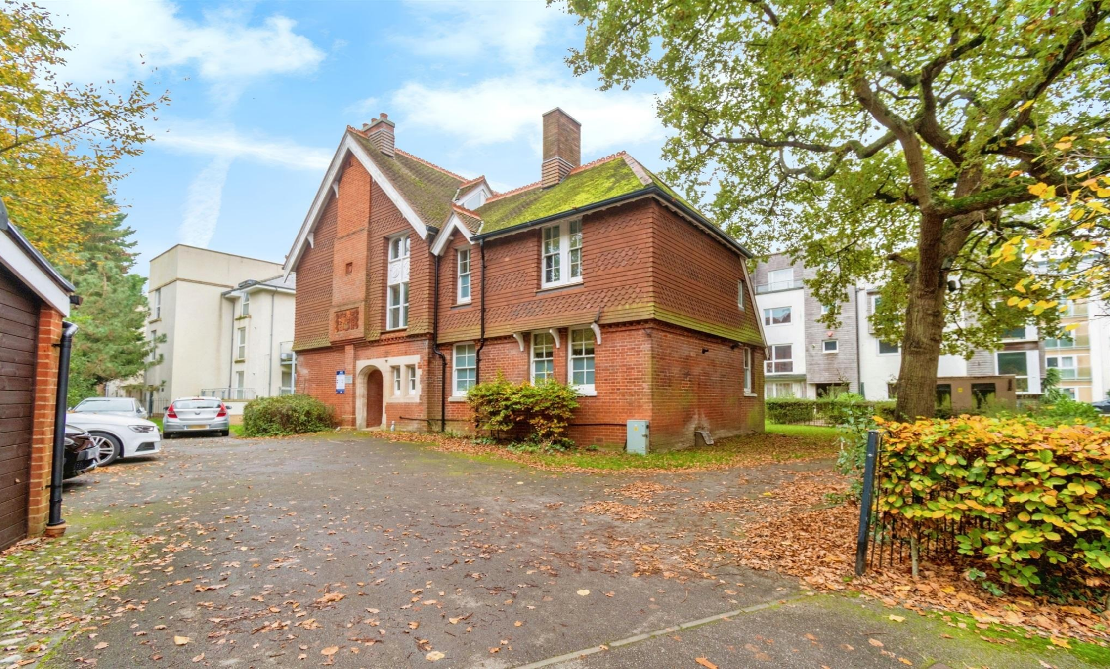
James Weld Close, Southampton SO15 2SW