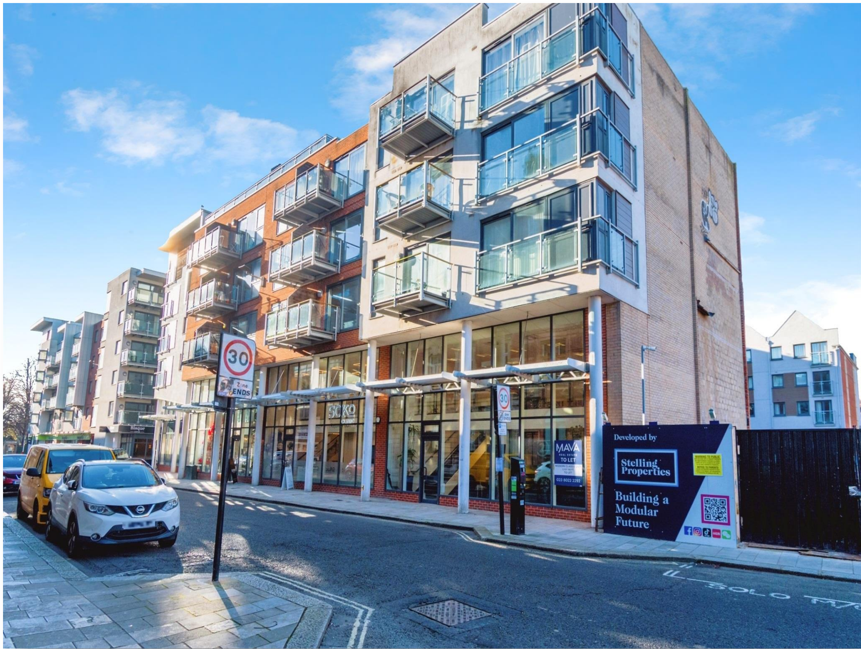
Kimber House, High Street, Southampton SO14 2EB