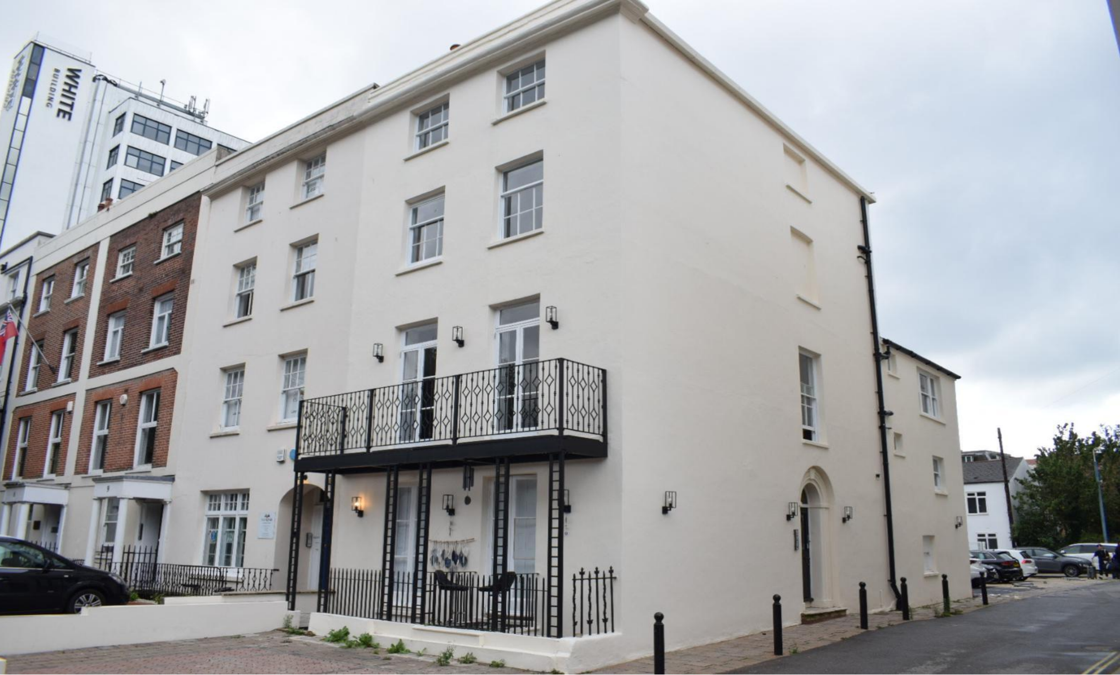
Regent House, Cumberland Place, Southampton SO15 2BH