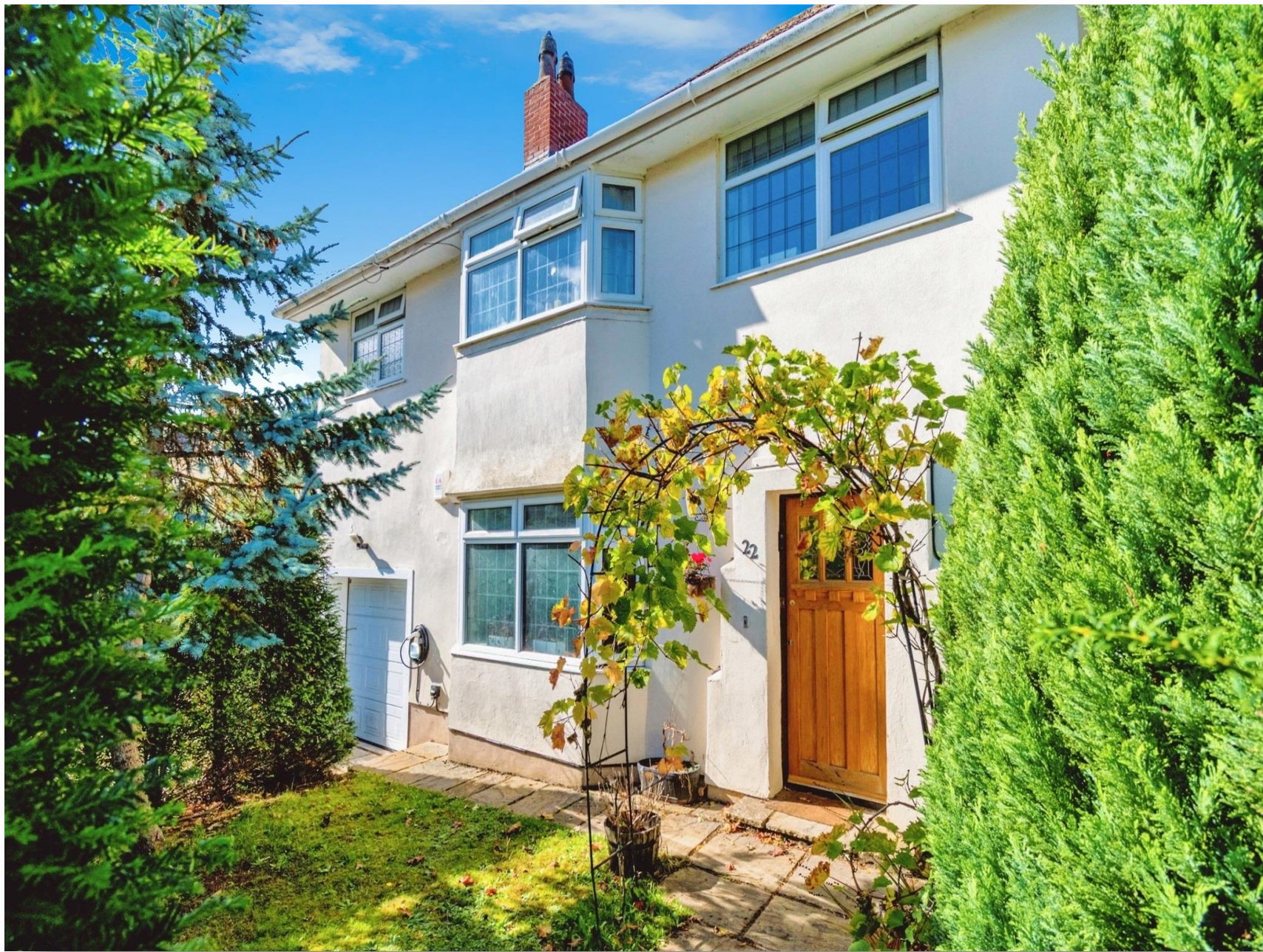
Bassett Dale, Southampton SO16 7GT