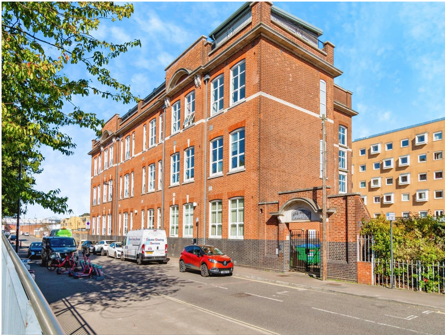
Andersons Road, SOUTHAMPTON SO14 5FR