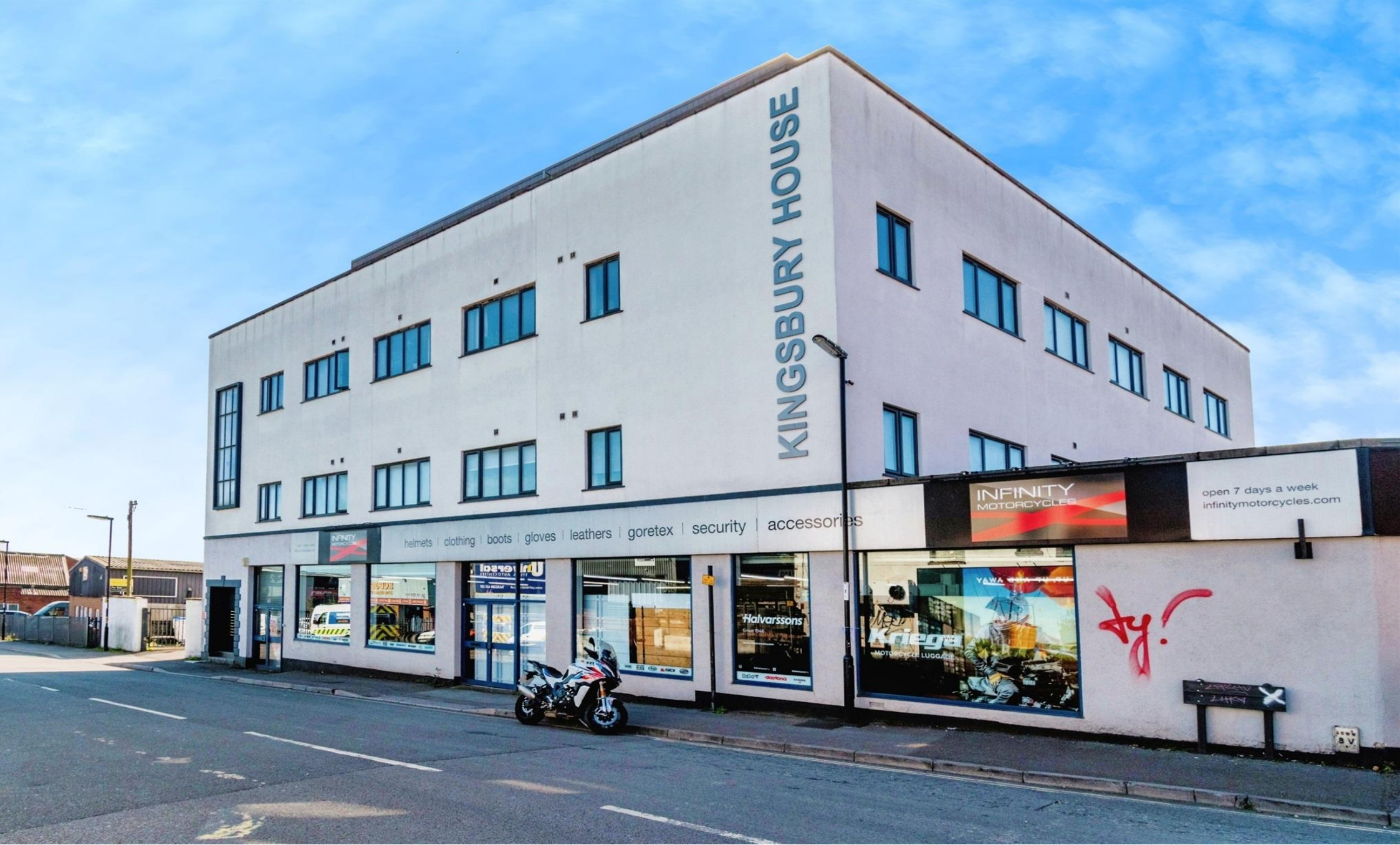
Kingsbury House, Kingsbury Road, Southampton SO14 0JT