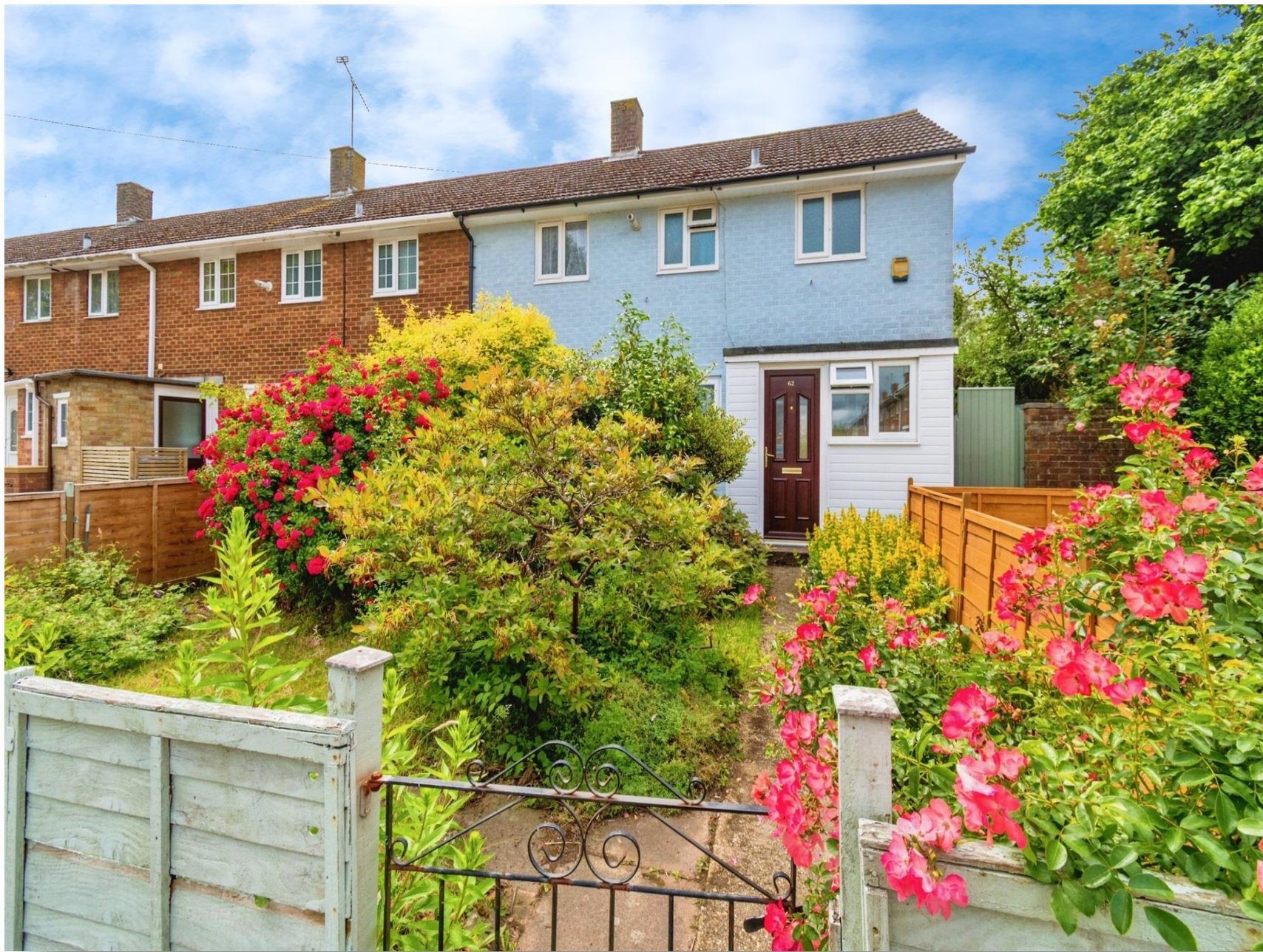
Sedbergh Road, Southampton SO16 9GY