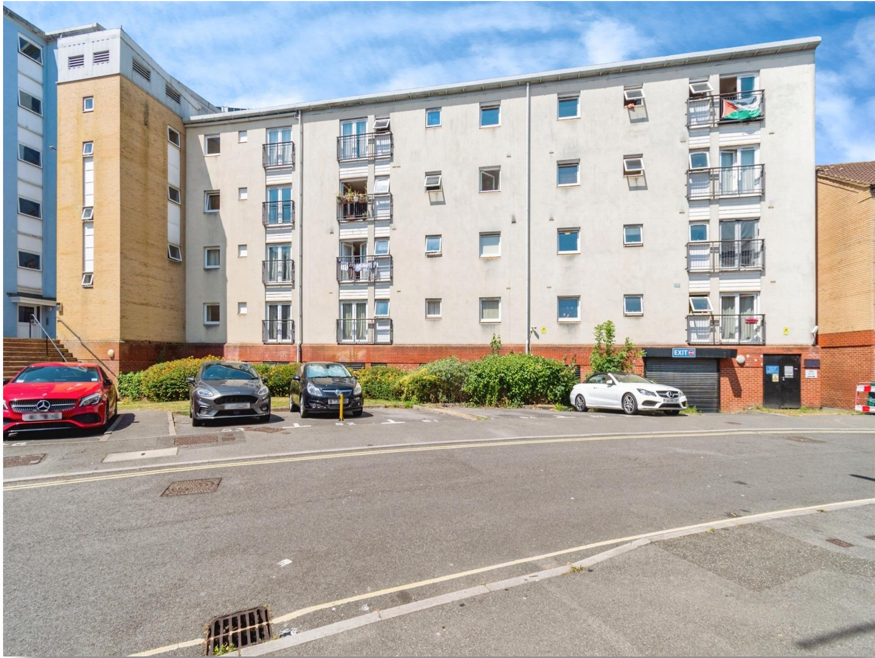
White Star Place, Southampton SO14 3GN