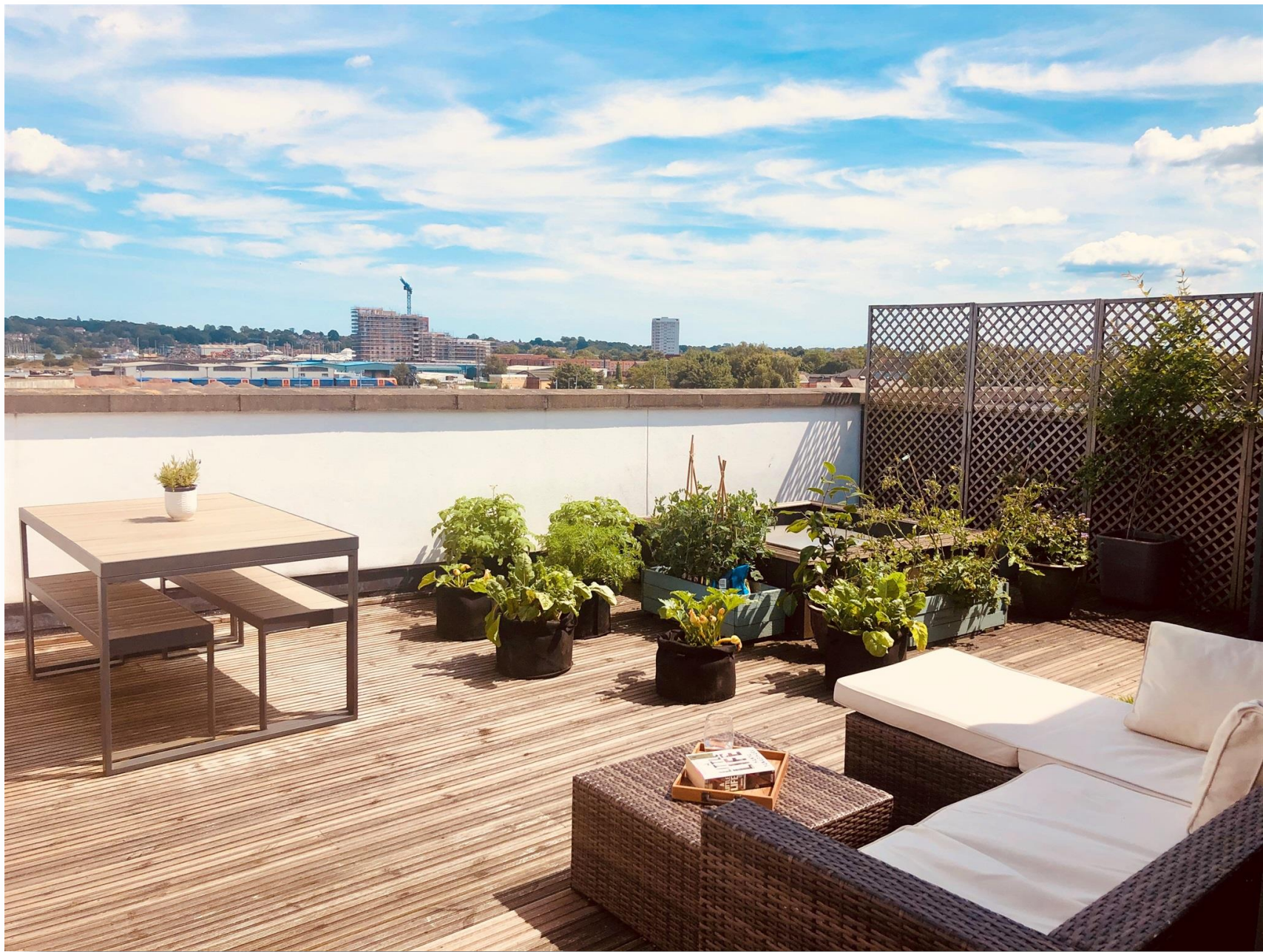
Kingsbury House Kingsbury Road, Southampton SO14 0JT