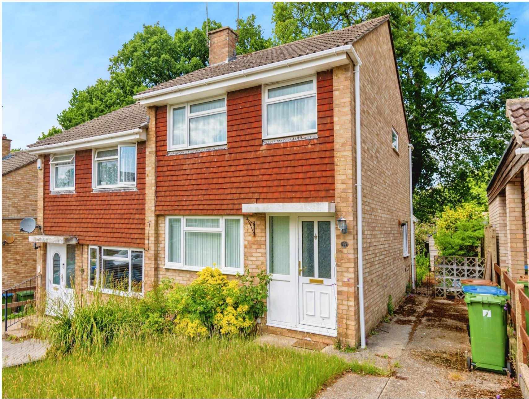
Cowdray Close, Southampton SO16 8EB