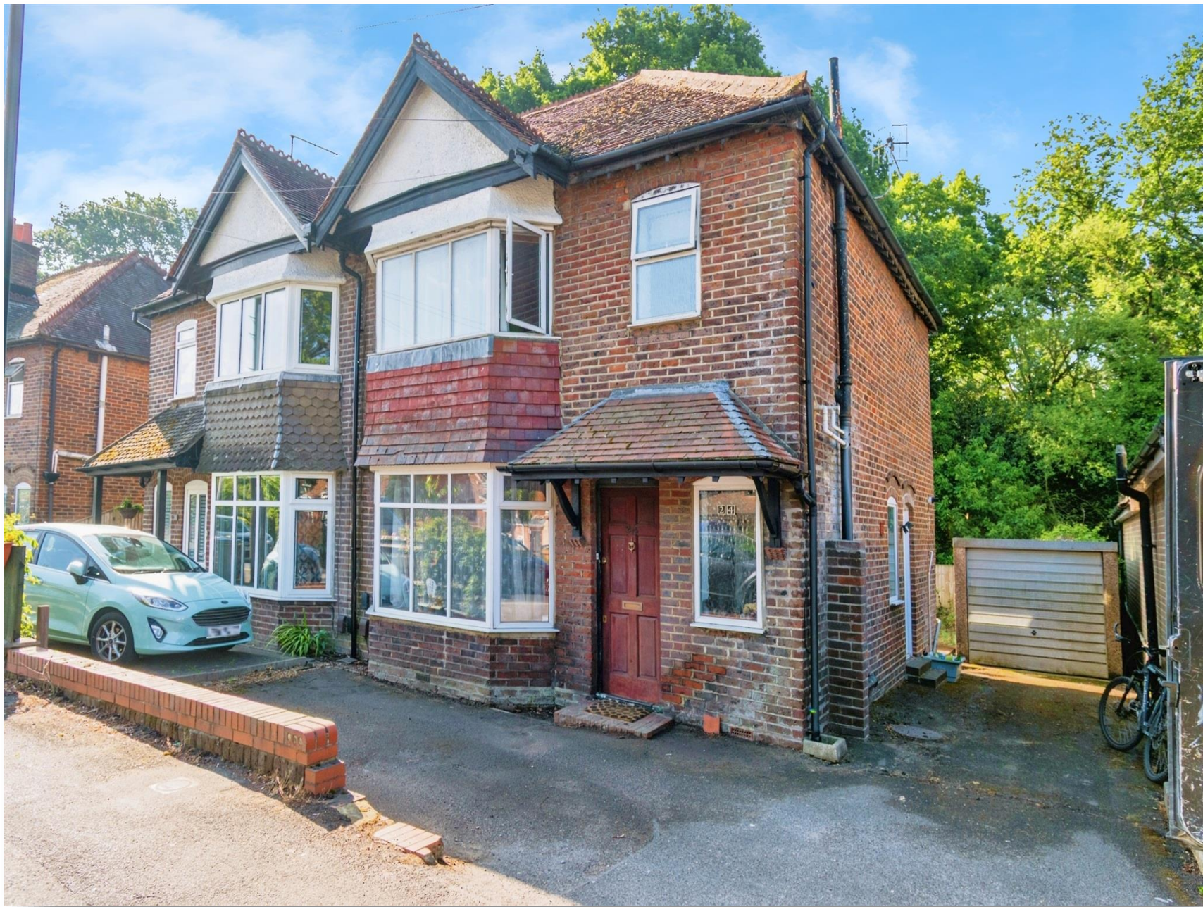
Burgess Road, Southampton SO16 7AH