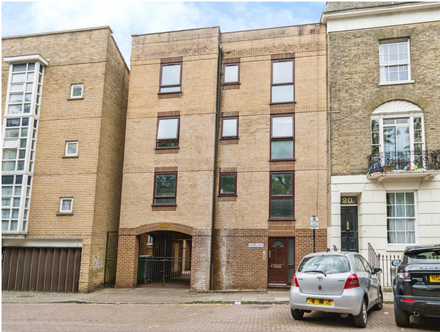
Emmerdale Court Cranbury Place, Southampton SO14 0LG