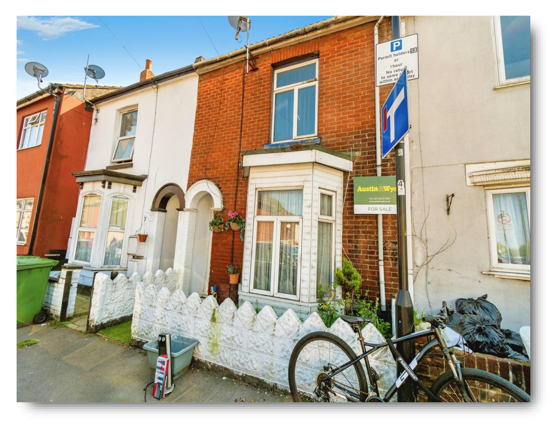
Union Road, Southampton SO14 0PT