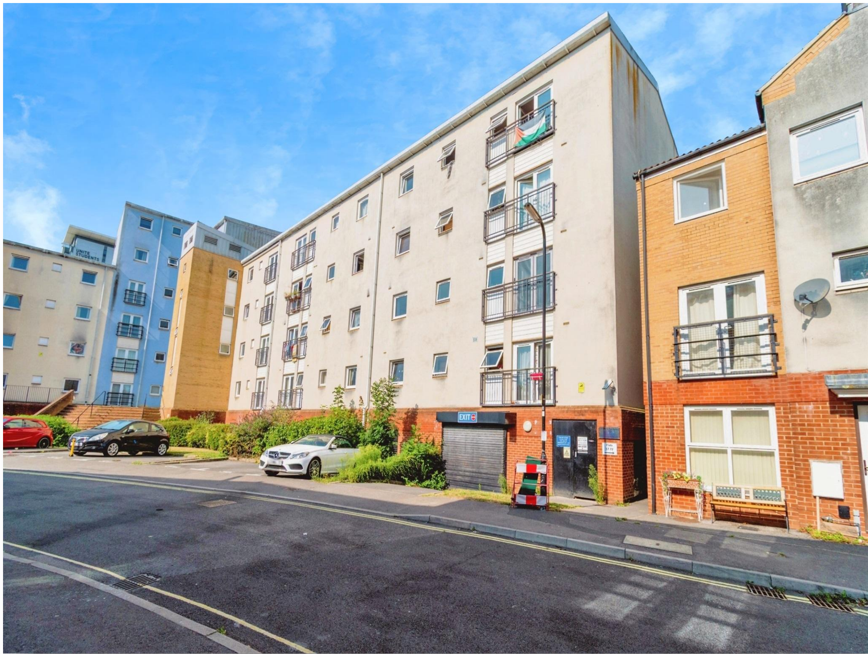
White Star Place, Southampton SO14 3GN