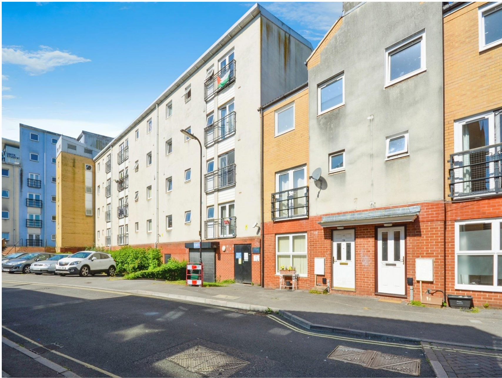
White Star Place, Southampton SO14 3GN