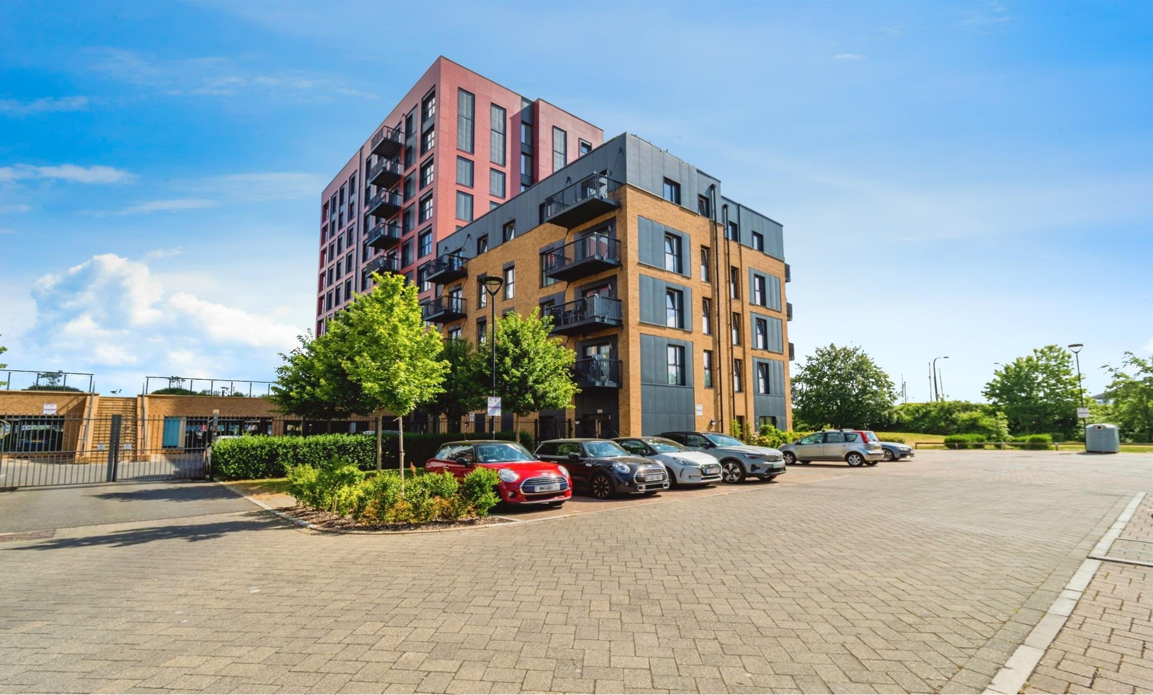
Television House, Meridian Way, Southampton SO14 0FS